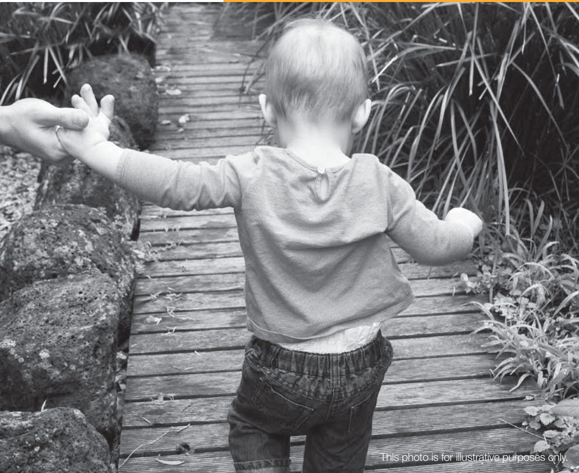
This photo is for illustrative purposes only.