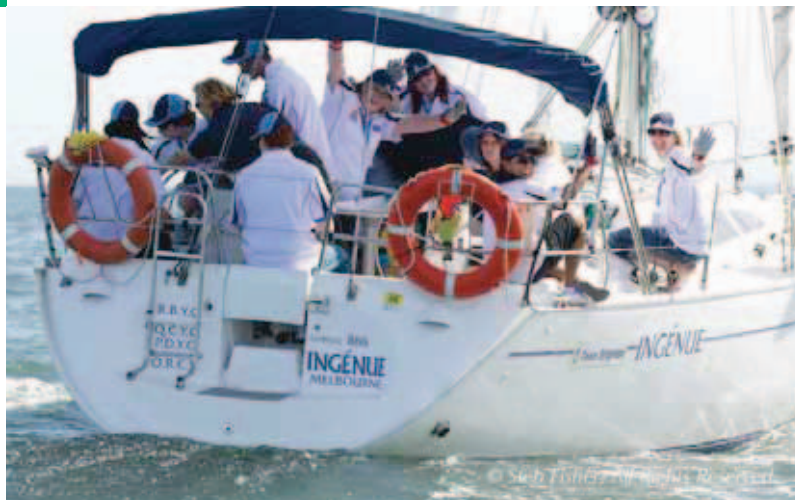
Above The crew set sail.

Fender Australia has introduced music to the lives of our young people; a truly remarkable gift.